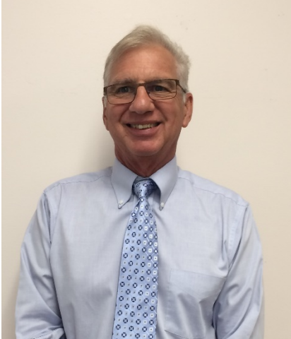
From the Desk of the Pastor

There is a twinkle in the eyes of most children this time of year. The holidays will soon be here and the anticipation of Thanksgiving and Christmas is on its way. It's a wonderful time to gather together at home and at church. The chill in the air reminds us too that Christmas is around the corner and the Christmas music will be playing at all the retail stores and on the radio stations. Christmas trees will be going up, lights will be strung; gift cards and gifts to be bought. And every child old enough to do so is already dreaming of what he or she will get from Santa when that magical day arrives. Waiting is always the hardest